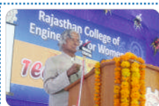
Dr. A.P.J. Abdul Kalam Former President of India