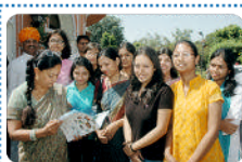
Vasundhara Raje Former Chief Minister of Rajasthan