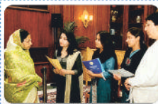
Pratibha Patil Former President of India