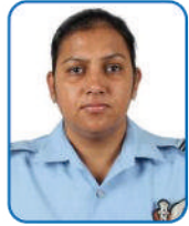
KAVITA BARALA (First Women Navigator of India)