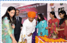
Princess Diya Kumari Deputy Chief Minister of Rajasthan