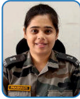
MAJ. PRASHASTI BHAT (Indian Army)