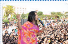
Vidhya Balan Bollywood Actress